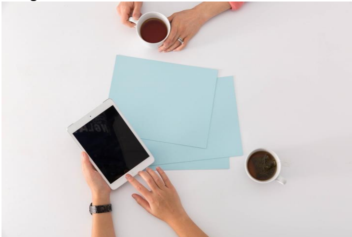
Using a hand-held device

(12-11-20)