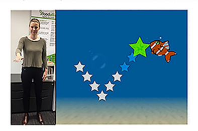
Reach and clap your hands over the balloons to pop them.

Capture as many stars as you can in the allotted time. Watch the example below.